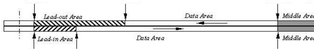
Dual Layer disc (OTP)

The program begins with its lead-in area situated on the first layer at the edge of the disc, continues through the data area and ends in the so-called middle area. The second layer then continues from the middle area through the data area to the lead-out area.